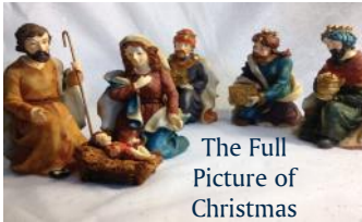
The Full Picture of Christmas

December 23rd, 5PM: Caroling and Cookies December 24th, 5PM: Christmas Eve Candlelight Service December 30th, 6PM: Singspiration December 30th, 7PM: Linger Longer