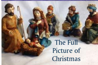
The Full Picture of Christmas

December 18th, 5-9PM: Youth/RAINE gift wrapping event December 19th, 6PM: Christmas Pot-Luck Dinner December 23rd, 5PM: Caroling and Cookies December 24th, 5PM: Christmas Eve Candlelight Service December 30th, 6PM: Singspiration December 30th, 7PM: Linger Longer